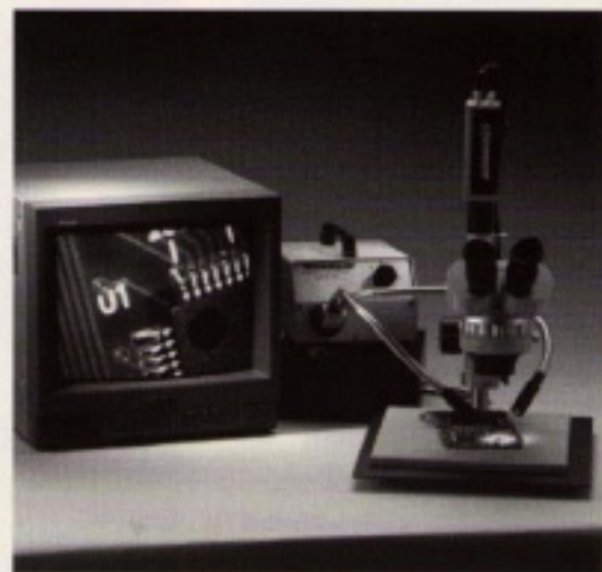
Techni-Spec ™ TSV-100