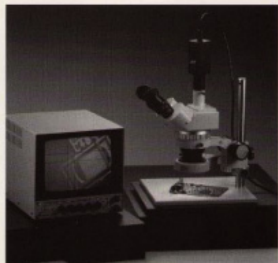
Techni-Spec ™ TSV-200